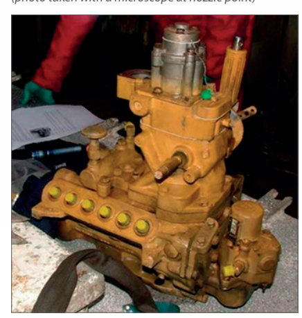
A fuel pump worn out by cavitation