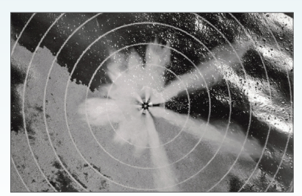
Poor injector spray pattern, from worn injector (photo taken with a microscope at nozzle point)

This is why modern technology requires very clean diesel, and this is where CJC<sup>™</sup> Oil Filters perform.